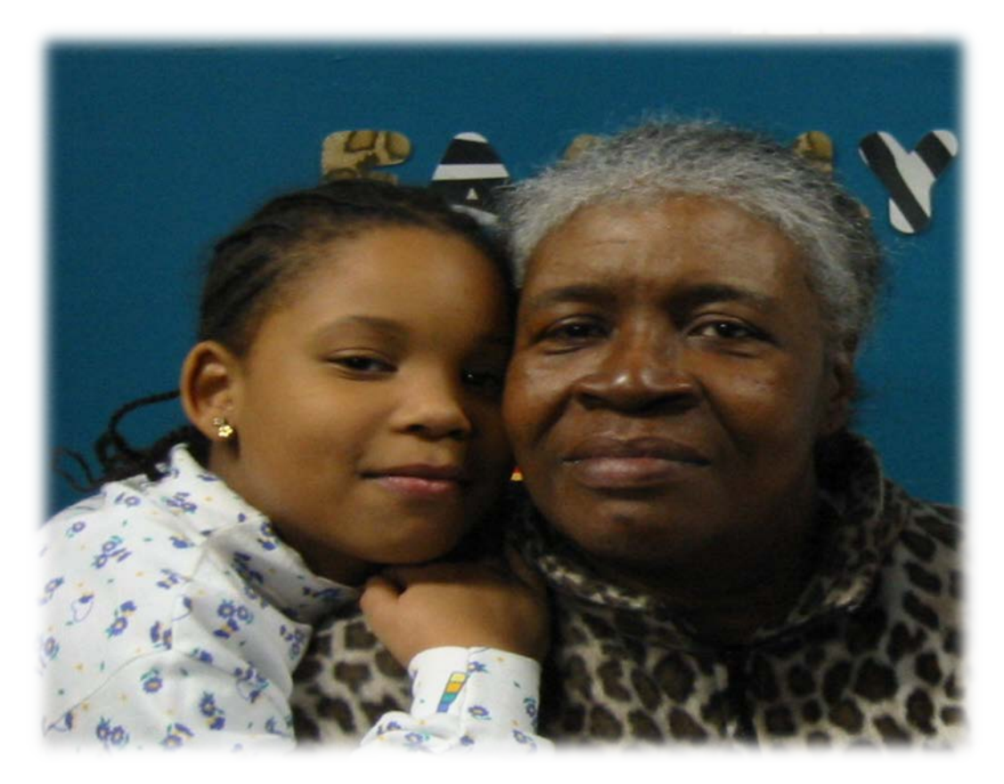
Social Security Administration distributes $2.6 billion each month to directly benefit children