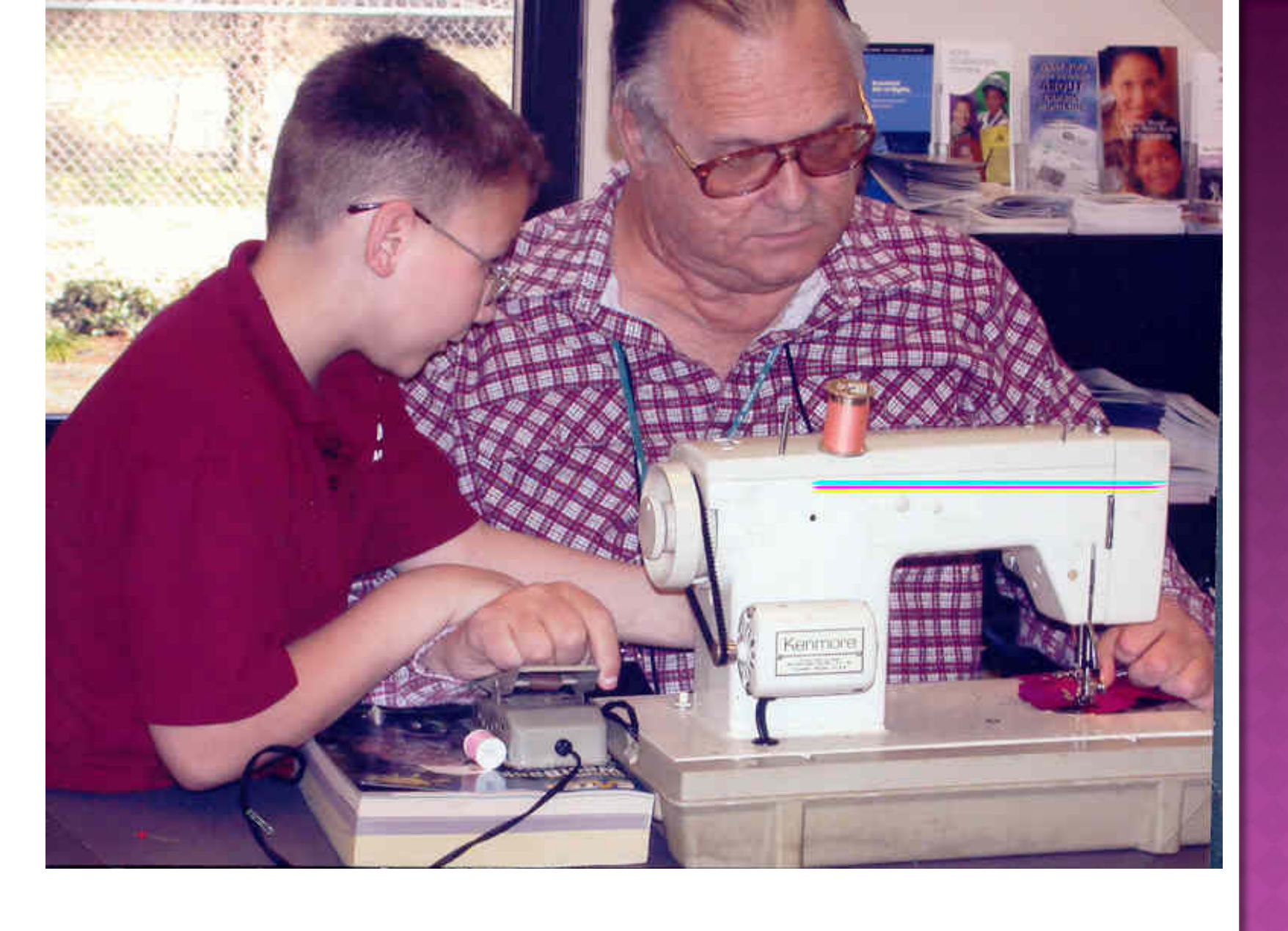
Sewing the Social Compact