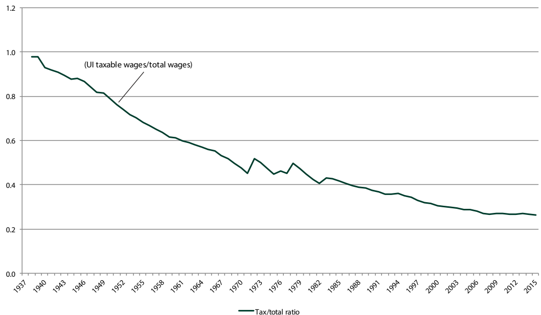
Figure 1. UI and Social Security taxable wage bases and the ratio of total to UI taxable wages, 1937-2015